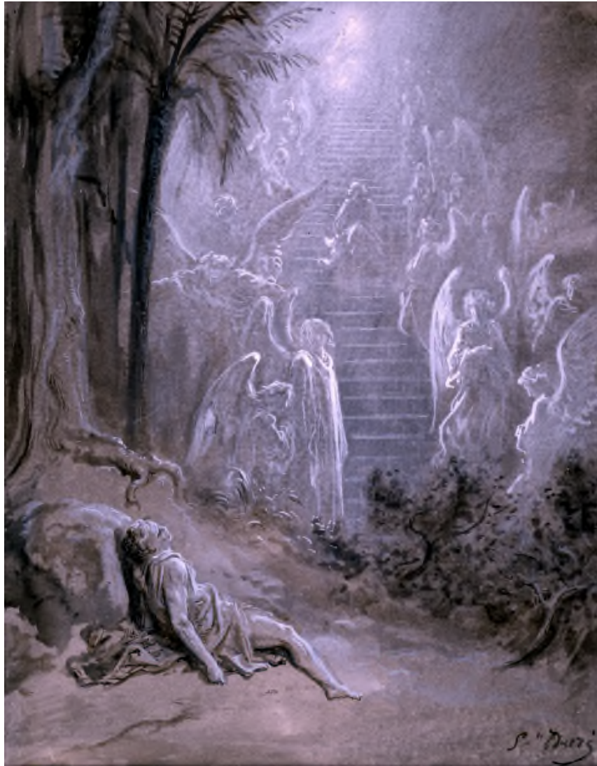
Jacob's Dream after Gustave Doré, 1832-1883

And Jacob dreamed and behold a ladder set up on earth...the top of it reached the heaven...and God said: "The Land whereupon thou liest to thee will I give it and to thy seed..."