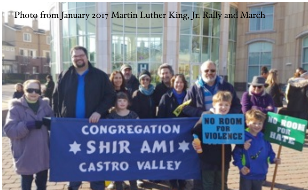
Photo from January 2017 Martin Luther King, Jr. Rally and March