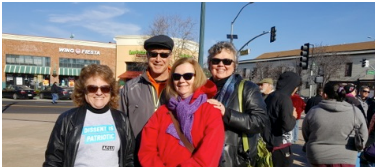
Photo from the Martin Luther King, Jr. Rally and March in Hayward, January 2017