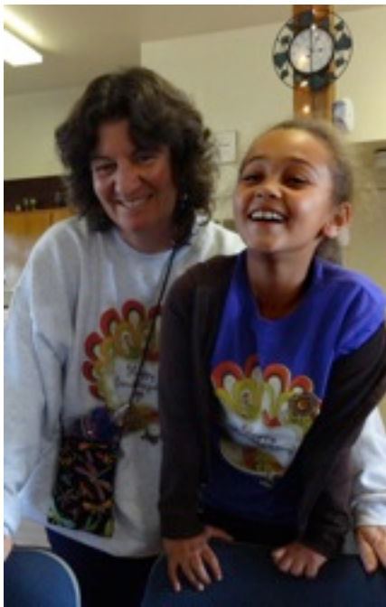
Photos from Chanukah Faire and Boutique at Shir Ami.