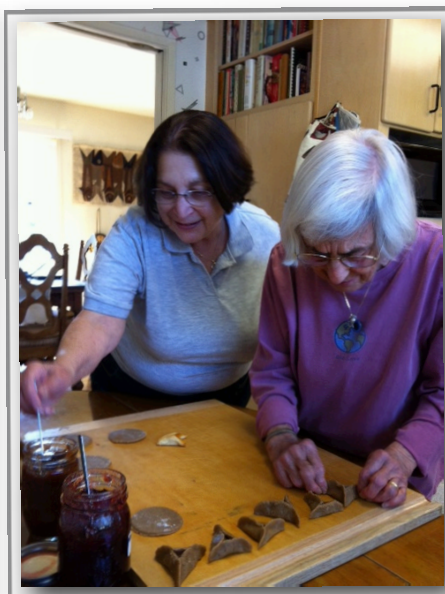
Baking for the Rescue in the Philippines event.