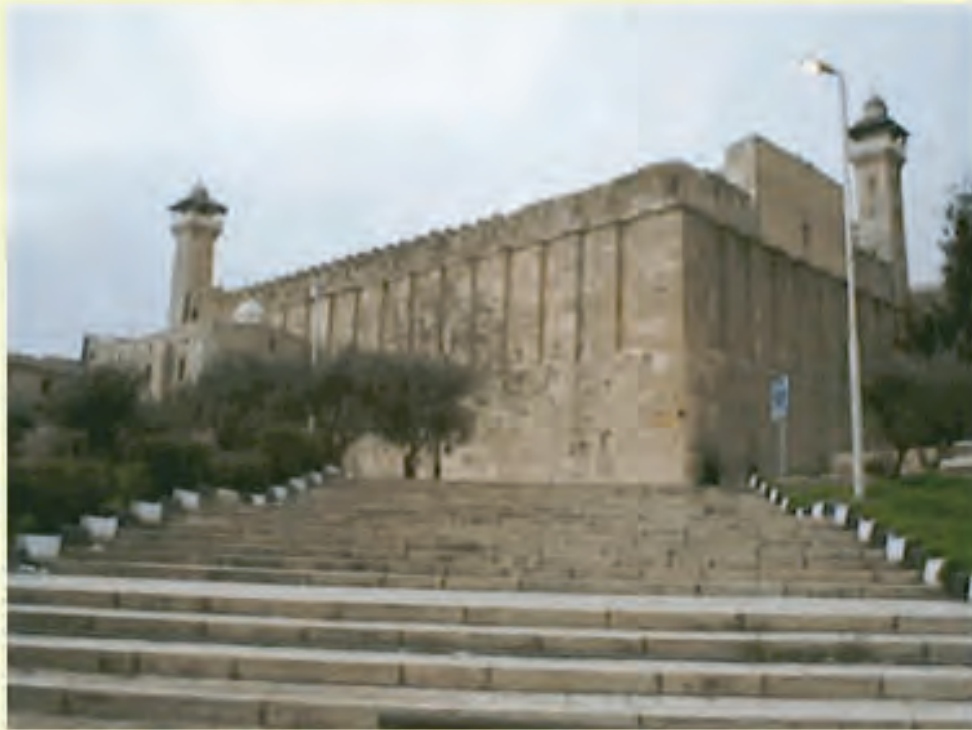
Burial place of Abraham, Isaac, Jacob, Sarah, Rebecca and Leah Hebron, West Bank

Shabbat Services Friday, October 25th at 7:30 PM will be conducted by