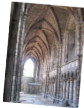
Edinburgh Cathedral Buttress