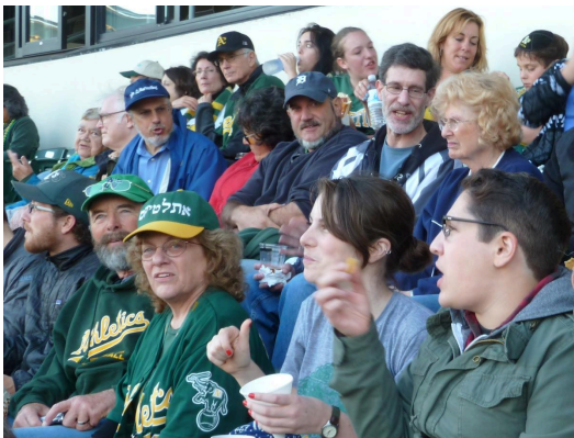
Photos from July 2013 Jewish Heritage Night at the A's baseball game

In order to access the "Members" area of the site, all congregation members will need a gmail account. Instructions will be forthcoming soon. In the meantime, enjoy the "new" site.