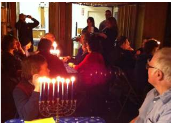
Chanukah 2012 Potluck & Service, Click here to see more photos on Facebook