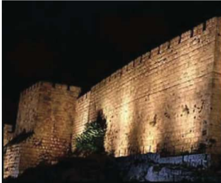
Present Walls of Jerusalem

On the 10th day of the Jewish month of Tevet (425 BCE), the armies of the Babylonia laid siege to Jerusalem. Thirty months later, the city walls were breached and the Holy Temple was destroyed. The Jewish people were exiled to Babylonia for 70 years. Many observe the 10th of Tevet as a day of fasting and mourning.