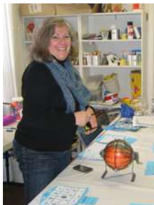
Chanukah Faire & Boutique, 2012