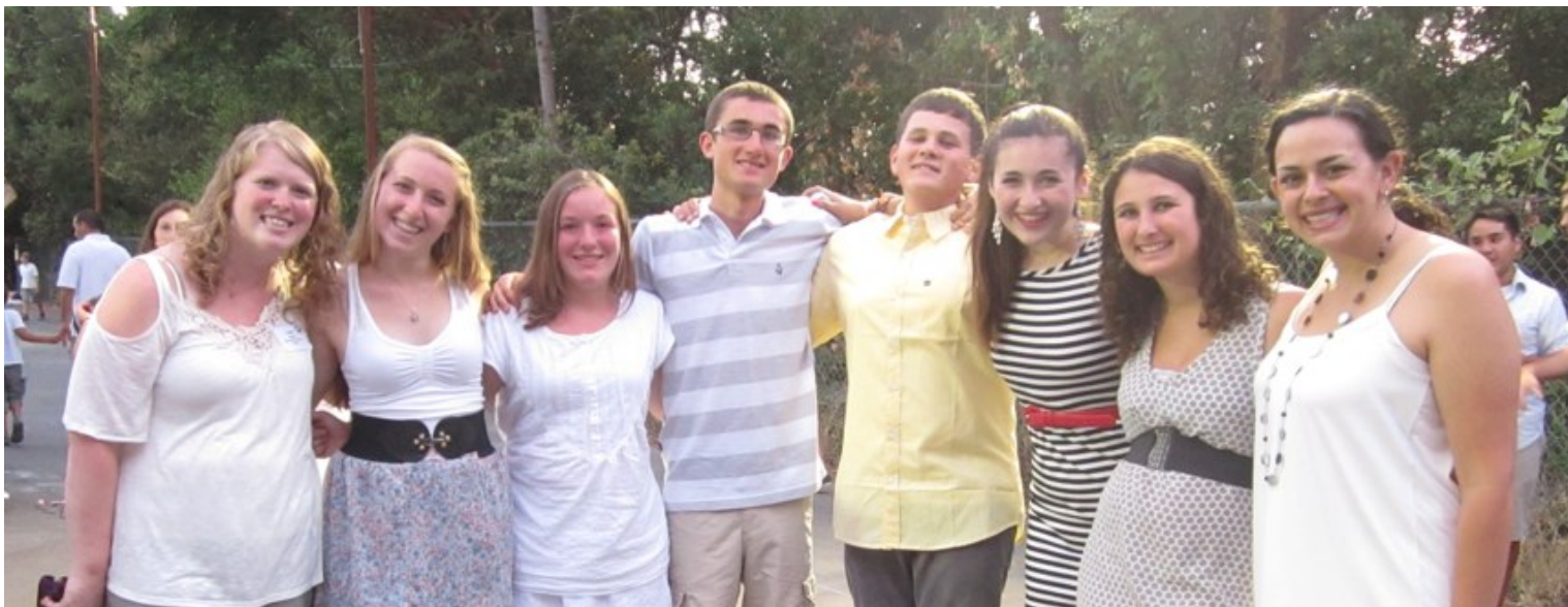
Photo from Camp Newman, Summer 2012