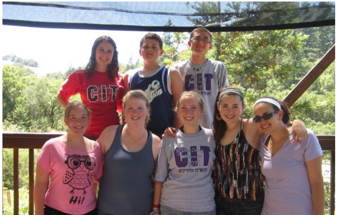
Photos from Camp Newman, Summer 2012