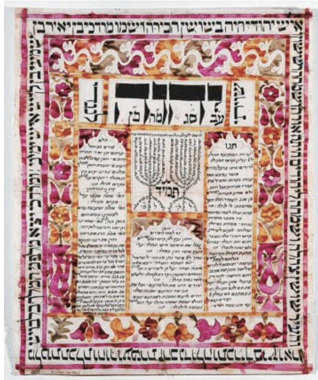
Shiviti, a decorative plaque usually set in the eastern wall of a synagogue, like a mizrach, to indicate the proper direction of prayer. This shiviti contains biblical verses written in the form of a menorah. From Persia. Ink and watercolour on paper, 16.5 x 13.3 inches (Israel Museum, Jerusalem, Israel).

Emor lists the annual Callings of Holiness—the festivals of the Jewish calendar: the weekly Shabbat; the bringing of the Passover offering on 14 Nissan; the seven-day Passover festival beginning on 15 Nissan; the bringing of the Omer offering from the first barley harvest on the second day of Passover, and the commencement, on that day, of the 49-day Counting of the Omer, culminating in the festival of Shavuot on the fiftieth day; a “remembrance of shofar blowing” on 1 Tishrei; a solemn fast day on 10 Tishrei; the Sukkot festival—during which we are to dwell in huts for seven days and take the “Four Kinds”—beginning on 15 Tishrei; and the immediately following holiday of the “eighth day” of Sukkot