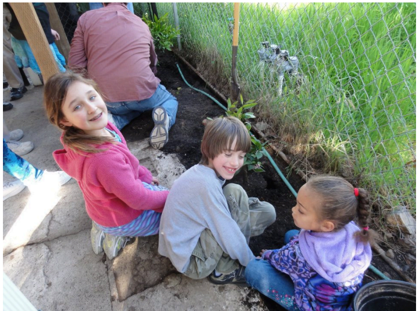
Tu B' Shevat at Shir Ami February 4