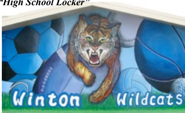
“High School Locker”

We welcome the four of you to Shir Ami and hope we'll get to meet you and see all that exciting artwork soon.