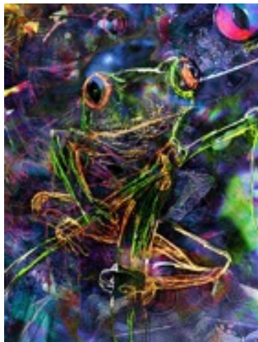
“Red eye tree frog”