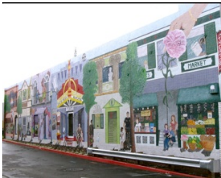
"A Street in Hayward"

One mural shows the actual stores and restaurants near the Bart station.