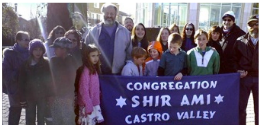
Shir Ami at Martin Luther King, Jr Event on January 16

https://www.facebook.com/me Share this album with anyone by sending them this public link: dia/set/?set=a.10150743911577222.510676.243740382221&type=3&l=db385cd955