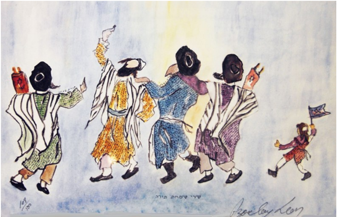
Simchat Torah Gallery, Jerusalem

Services on Friday, Oct. 21st at 7:00 PM