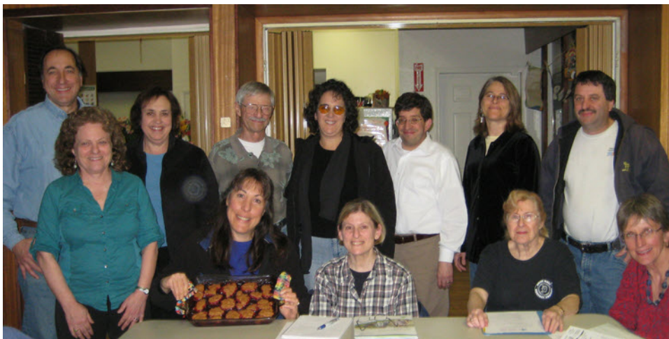
Shir Ami Board Meeting, January 2011