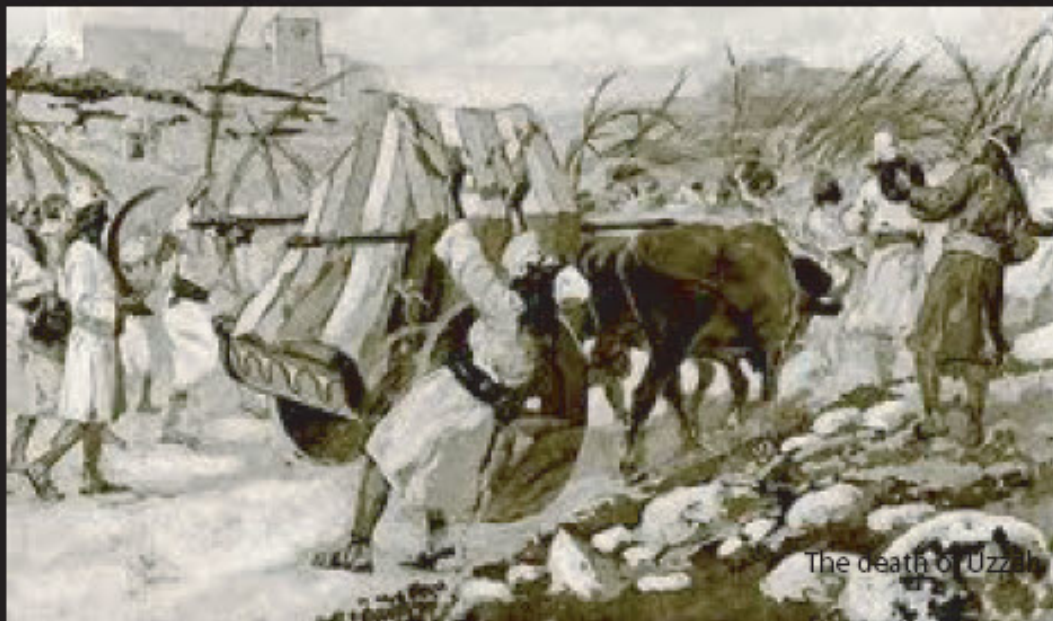
The death of Uzzah

David gathered together all the chosen men of Israel — 30,000 in all — and went to retrieve the Ark of the Covenant from Baale-Judah. They brought the Ark out of the house of Abinadab and set it on a new cart, and Abinadab's sons Uzzah and Ahio drove the cart, with Ahio going before the Ark. When they came to the threshing-floor of Nacon, the oxen stumbled, and Uzzah put out his hand to steady the Ark. In anger, G-D smote Uzzah for his error, and Uzzah died by the Ark. David was angry with G-D; he was unable to understand G-D's wrath.