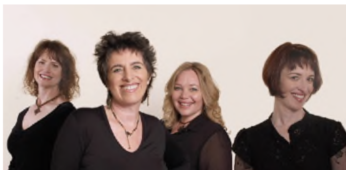
Vocolot in Concert

For more information or to get a festival brochure, email marilyn@jfed.org or call 510.839.2900 extension 256.