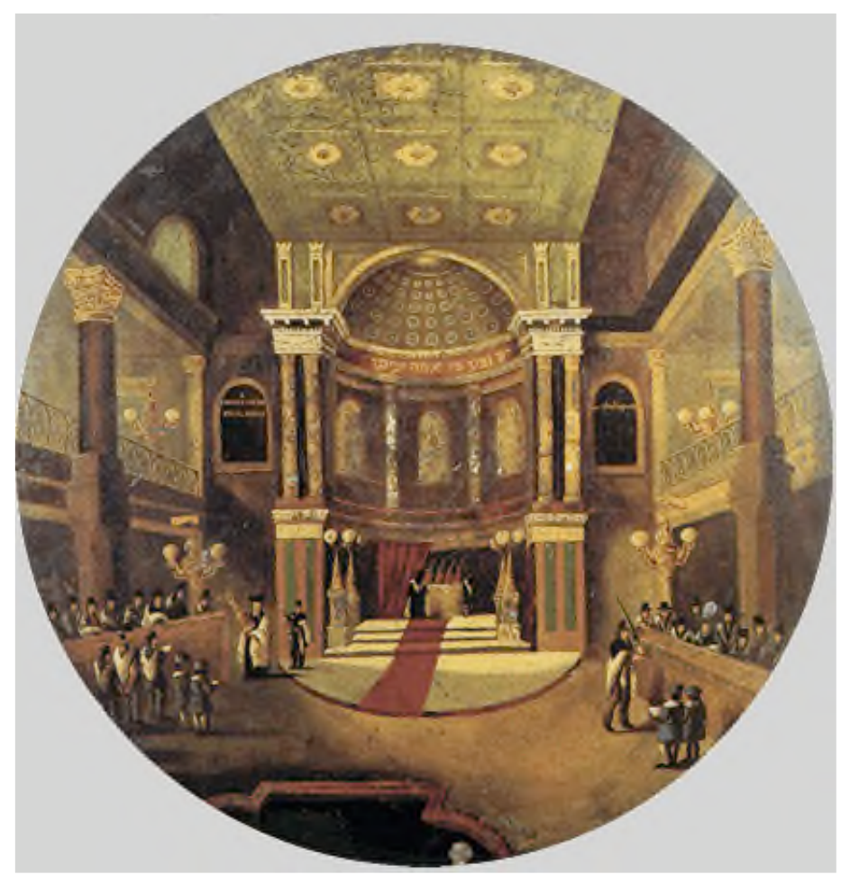
New Synagogue in London, 1850, from "The Jewish World" (Kedourie, Harrison House, New York 1979)

The blessings of upholding the tradition are described as are the fates of rejecting the teachings of Torah.