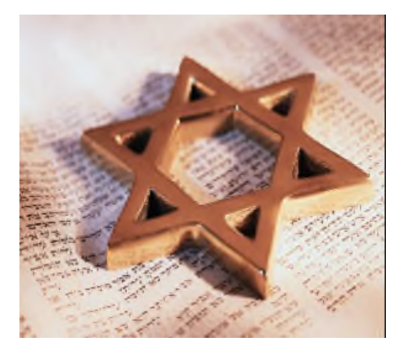
April 1st at 10:30 for the school-wide seder, April 22nd at 11:30 and May 20<sup>th</sup> for the end of the year events

Adult education (not part of the B'Nai Mitzvah class) will continue as we have been, with a little bit of Torah, a little bit of Hebrew and a bit of general study. In April, we will meet on the 29<sup>th</sup>. In May, we will meet on May 6<sup>th</sup> and May 13<sup>th</sup> from 10:30 am to 12:30 pm.